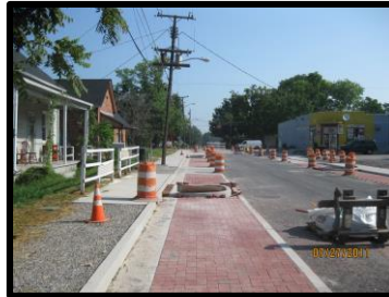
Maney Ave reconstruction with permeable pavers