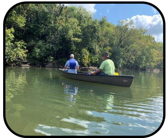
9/15/2021 -Screening outfalls along West Fork Stones River. City TV filming.

Staff observed an increase in building/auto washing during this year’s screening. Targeted education material may be distributed to known washers in a future outreach project.