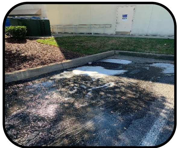
9/28/2021 - Wash water in drain at Stones River Mall. Flow not leaving property instead infiltrating through joint in pipe. No evidence of washing following day (9/28/21).